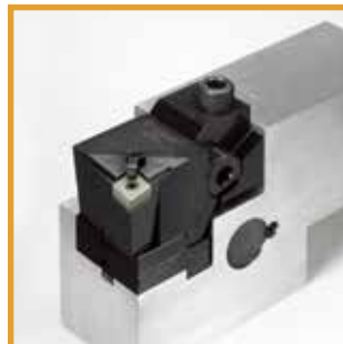
Quick Change Roll Tool