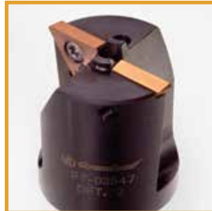
Pod Bore Head