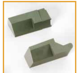
Race Track Groovers