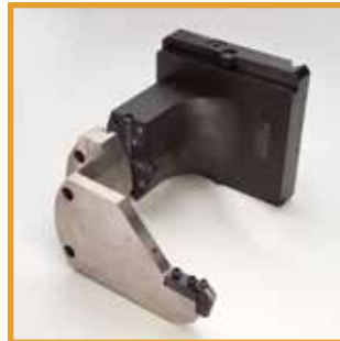
Aero Grooving Tools