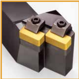
Roll Lathe Tool