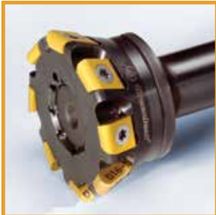
Long Shaft End Mill