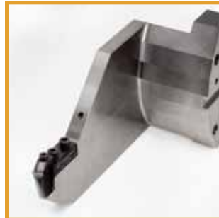
Heavy Metal Head