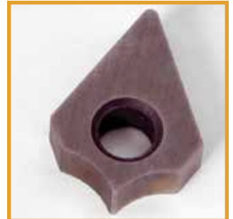
Special Form Insert